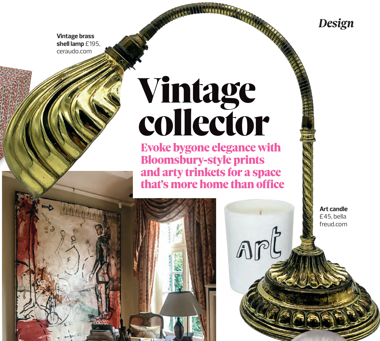
Art candle £45, bella freud.com