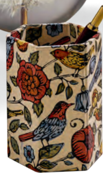
Pen pot £20, choosing keeping.com