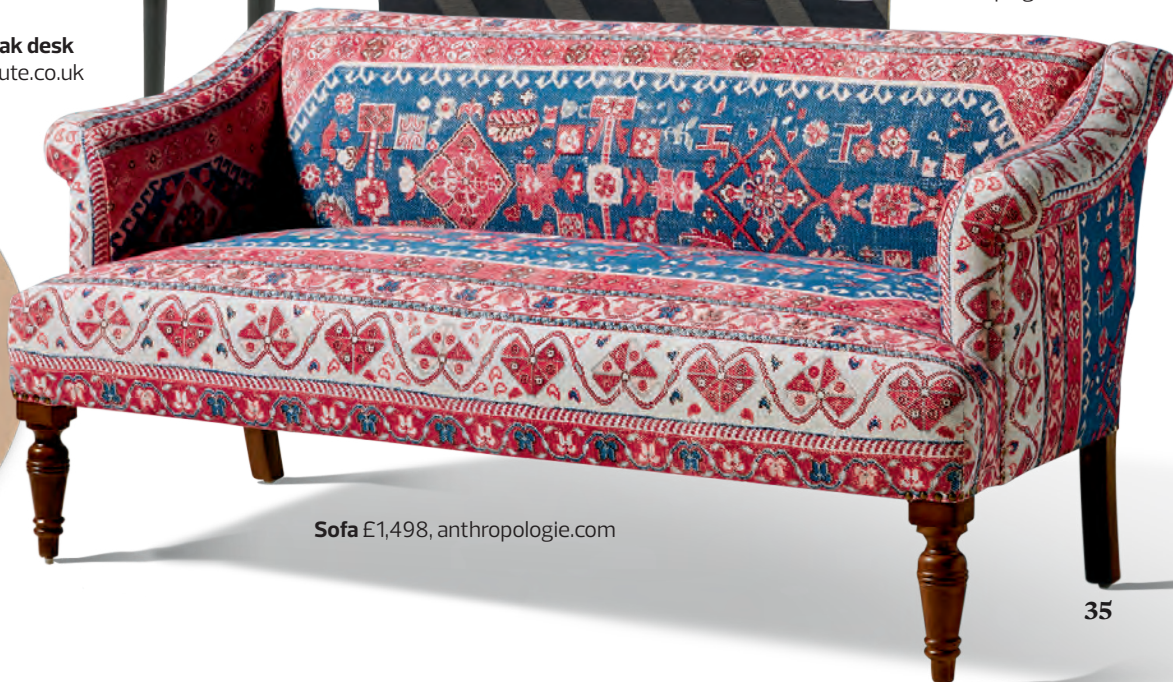
Sofa £1,498, anthropologie.com